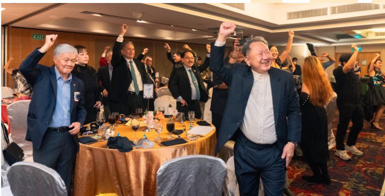
Starting out E Club 3310 Installation with some dance moves