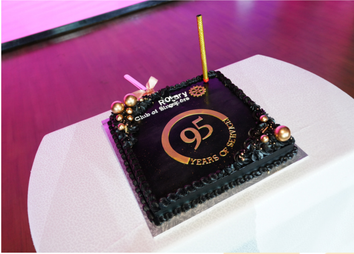
Rotary celebrates 95 years in Singapore as RC Singapore, first club of D3310 celebrates its birthday