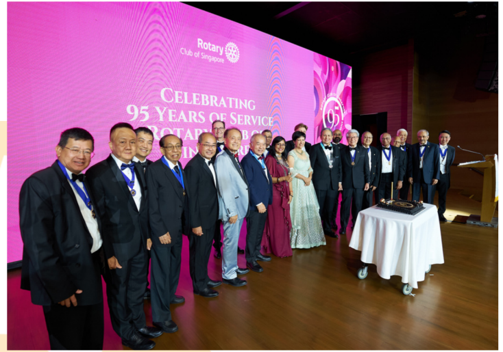
All the Past President present invited for cake cutting ceremony