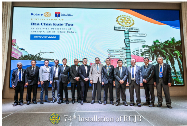
At least 12 Spontaneous PHFs raised from dedicated members of RCJB