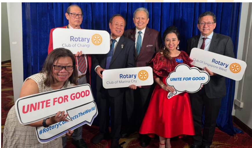
2025-2026 Presidents present at RC Changi Installation