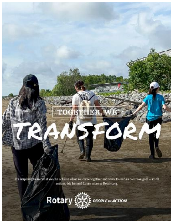
ROTARACT CLUB OF SWINBURNE SARAWAK

Go to https://brandcenter.rotary.org/en-us/people-of-action