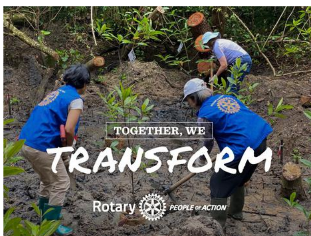
RC MARINA CITY