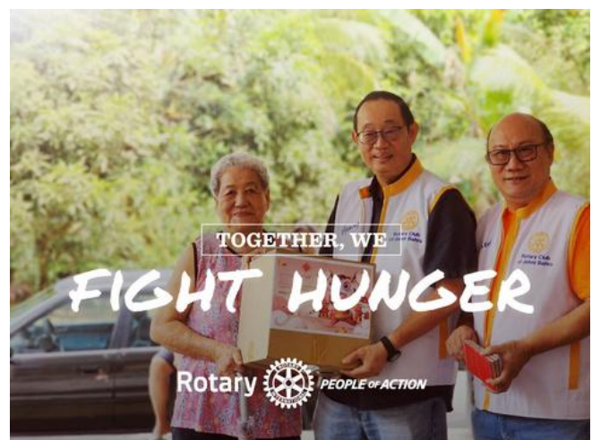
RC JOHOR BAHRU