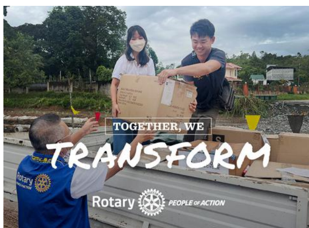
RC KUCHING CENTRAL

Rotary Club of Sentosa https://fb.watch/jiKJsvz2Sw/