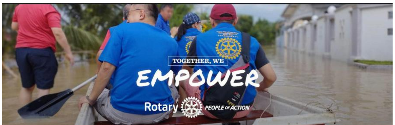
RC BATU PAHAT