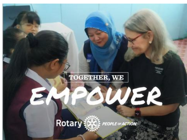
RC KOTA KINABALU PEARL