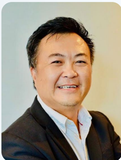
RTN BEN LO Committee