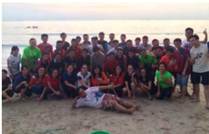
The Rotaract Club of UMS KAL's (Labuan) 'International Understanding Day'