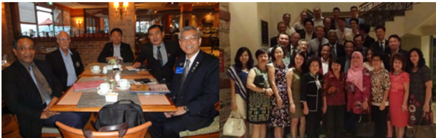
27th : DG Visit to the Rotary Club of Kota Kinabalu South