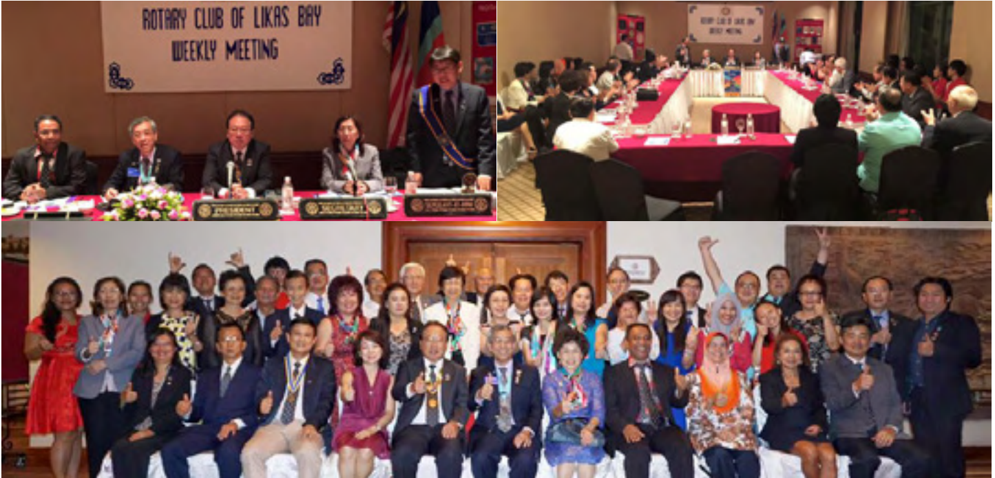
21st : DG Visit to the Rotary Club of Likas Bay