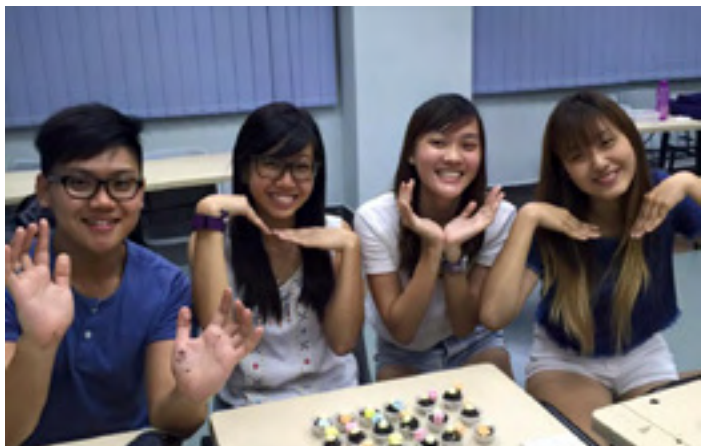
The Rotaract Club of Ngee Ann Polytechnic's 'No Oven Baking Class'