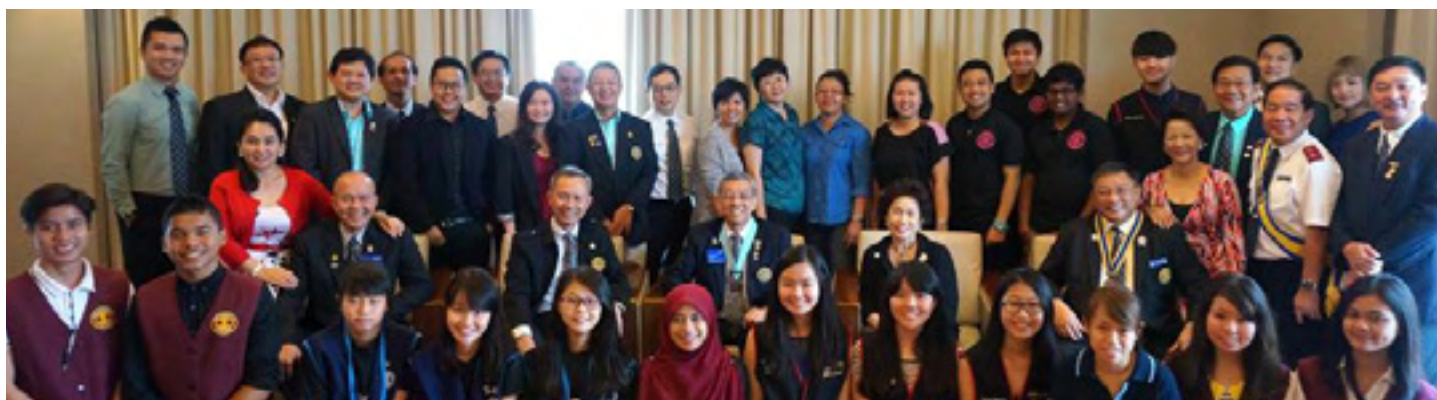
30th : DG Visit to the Rotary Club of Shenton