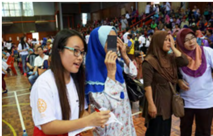
The Rotaract Club of UMS and Likas Bay's 'Avoidable Blindness Outreach' in Ranau, Sabah