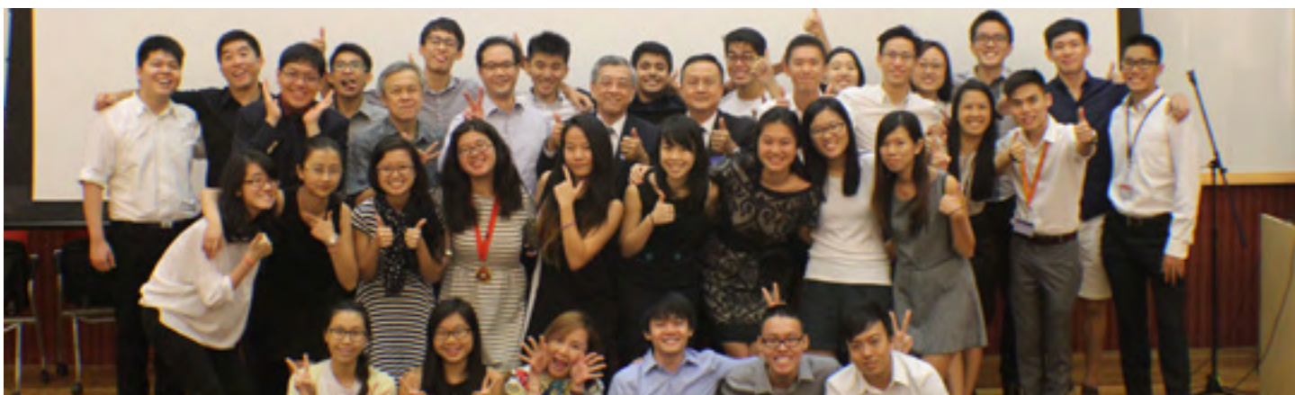
Installation of Rotaract Club of Singapore City