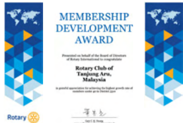
Rotary Club of Tanjung Aru for achieving the highest growth rate of members under 40 in D3310