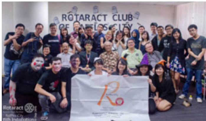
Installation of Rotaract Club of Raffles City