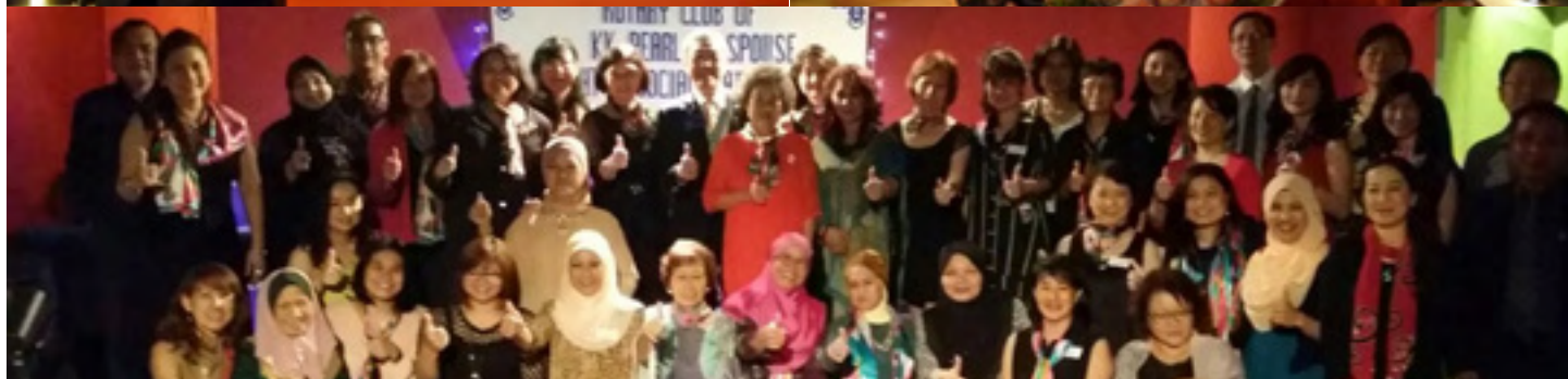
20th : DG Visit to the Rotary Club of Kota Kinabalu Pearl