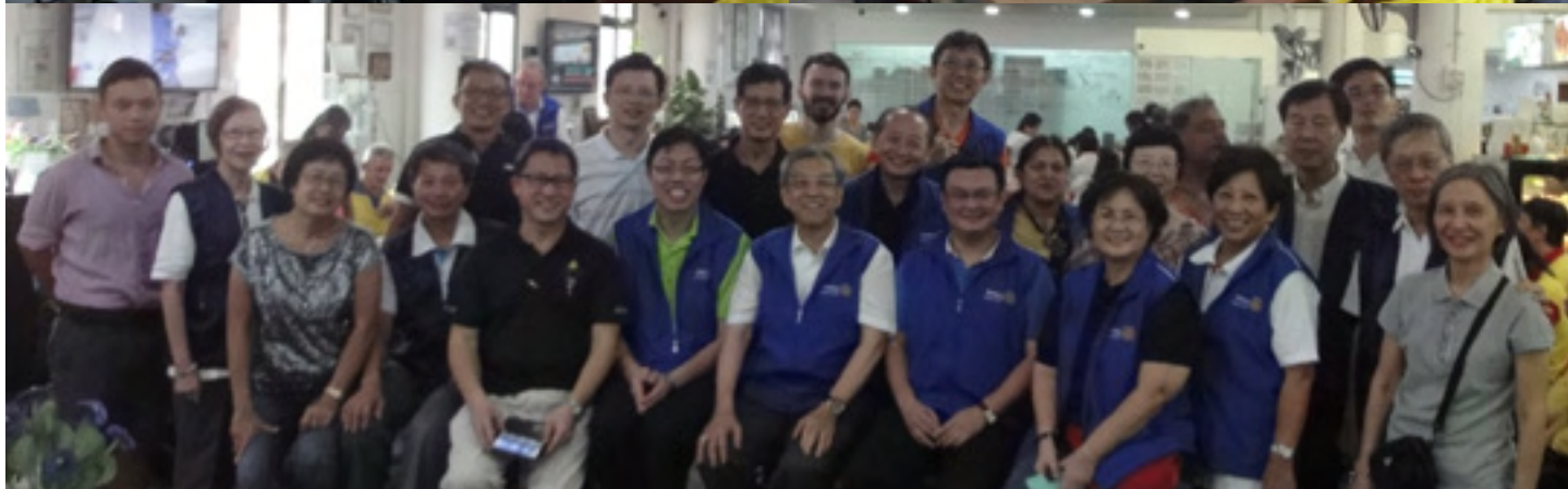
10th : Visit to Rotary Club of Bukit Timah's 'Dignity Kitchen' project