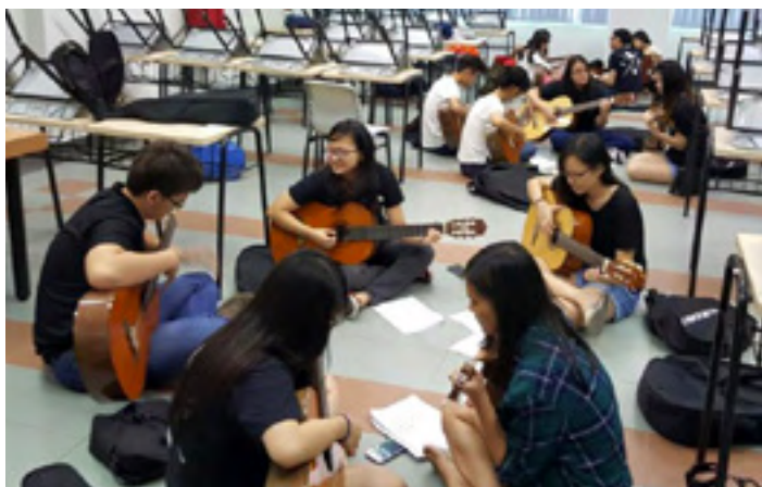
The Rotaract Club of Ngee Ann Polytechnic's basic guitar training