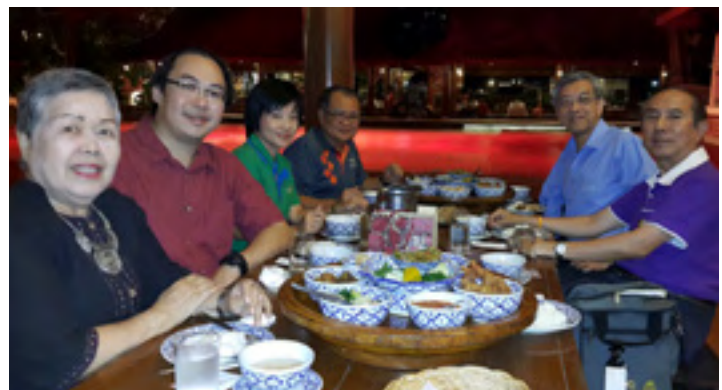
22nd - 25th : Meeting with District Conference Thailand committee in Chiang Mai