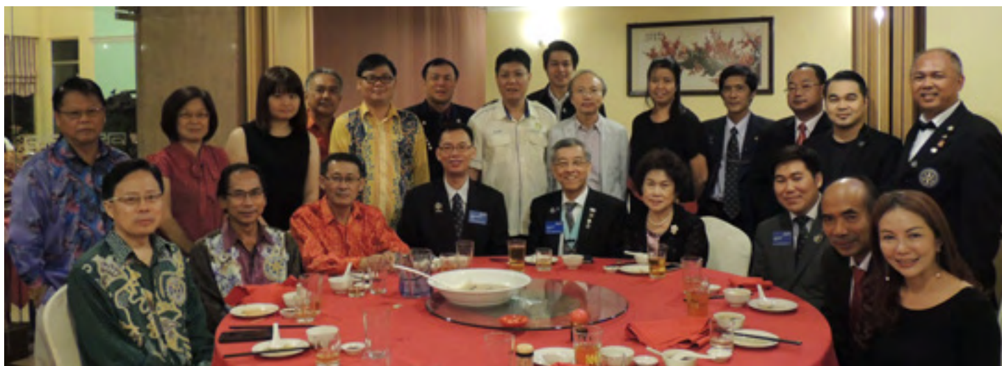
29th : DG Visit to the Rotary Club of Bintulu Central and visit to RH Garena Anak