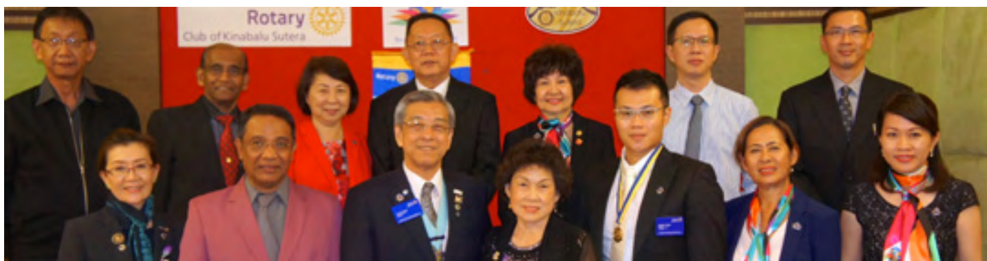
19th : DG Visit to the Rotary Club of Kinabalu Sutera