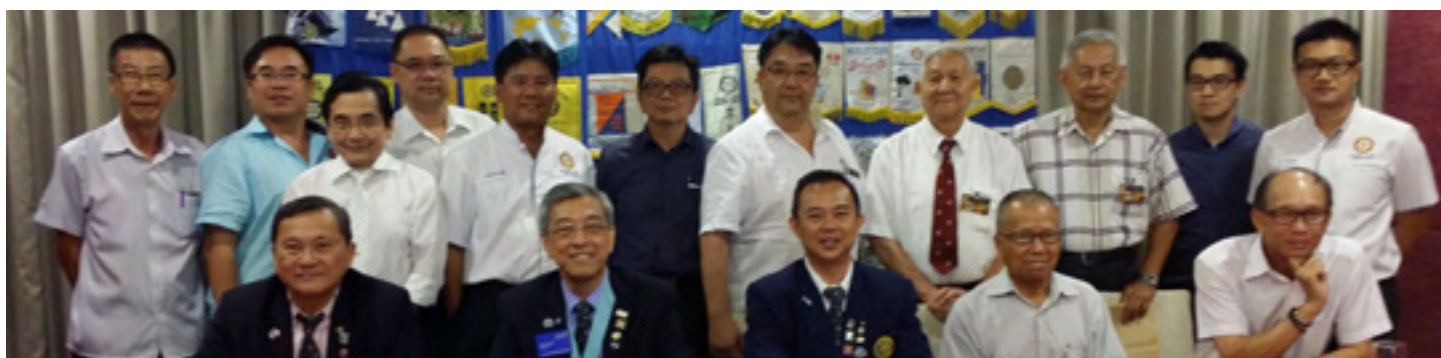
7th : DG Visit to the Rotary Club of Sandakan