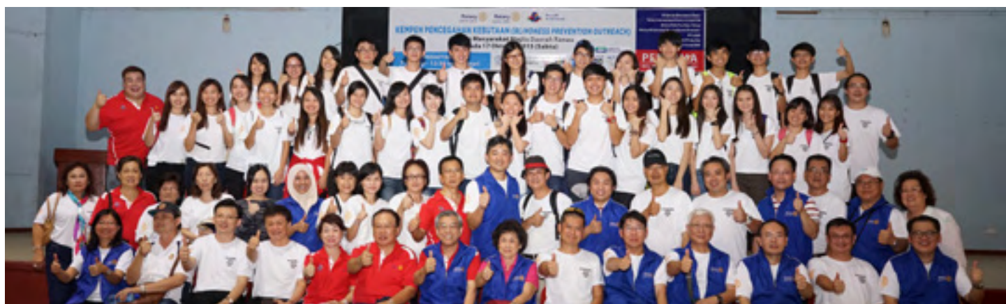
17th : Joint District 3300 & 3310 Avoidable Blindness Outreach in Ranau, Sabah