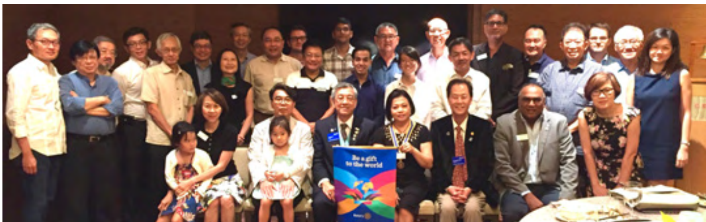
9th : DG Visit to the Rotary Club of Pandan Valley