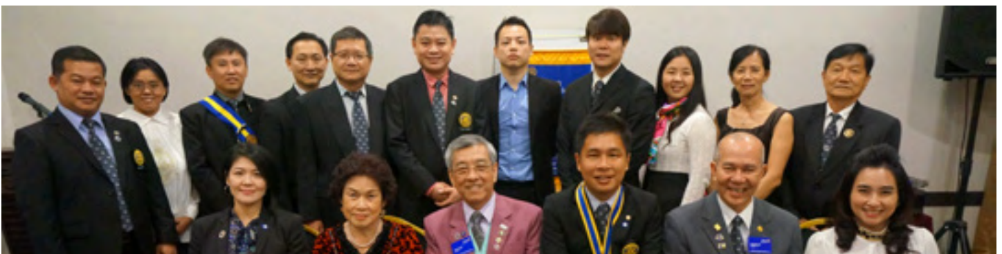
30th : DG Visit to the Rotary Club of Kuching South