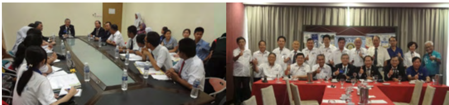
6th : DG Visit to the Rotary Club of Sandakan North and meeting with Interactors