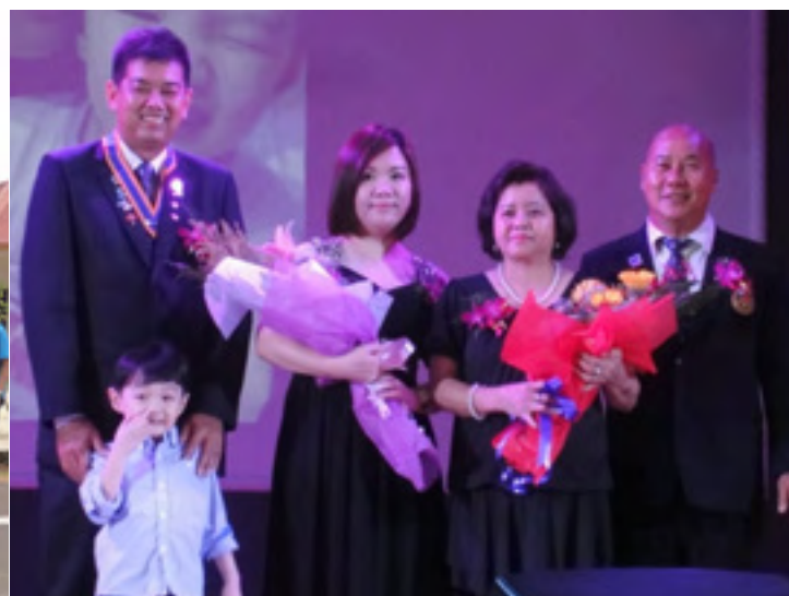
10th : DG Visit to the Rotary Club of Mersing's Haemodialysis Centre and Installation