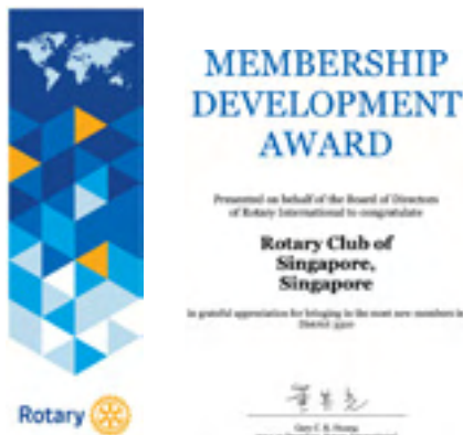
Rotary Club of Singapore for bringing the most number of new members