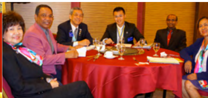
Board of Directors Meeting