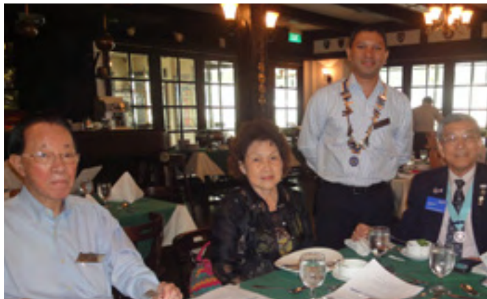
2nd : DG Visit to the Rotary Club of Singapore North