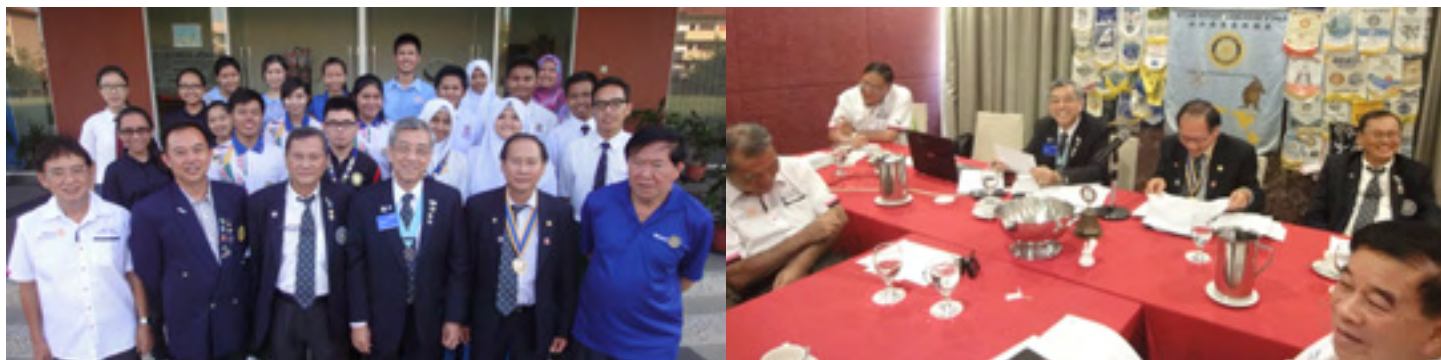
3rd : DG Visit to the Rotary Club of Sandakan North