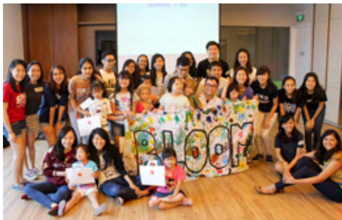
The Rotaract Club of Singapore Management University's Project 'Silver' and Project 'Bloom'