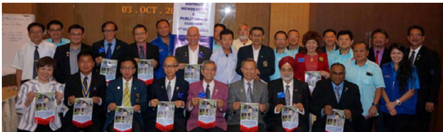
3rd : District Membership and Public Image & Relation Seminar in Kuching