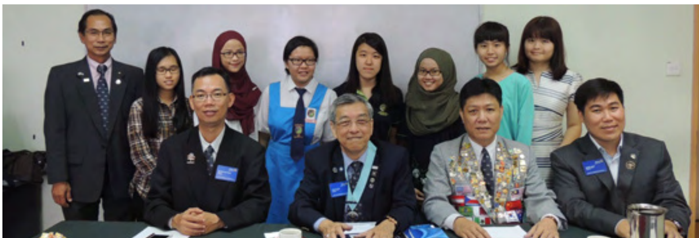
28th : DG Visit to the Rotary Club of Bintulu