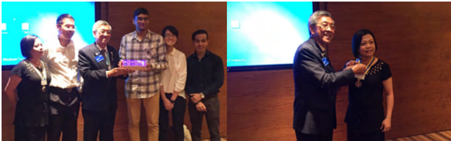
9th : DG Visit to the Rotary Club of Pandan Valley