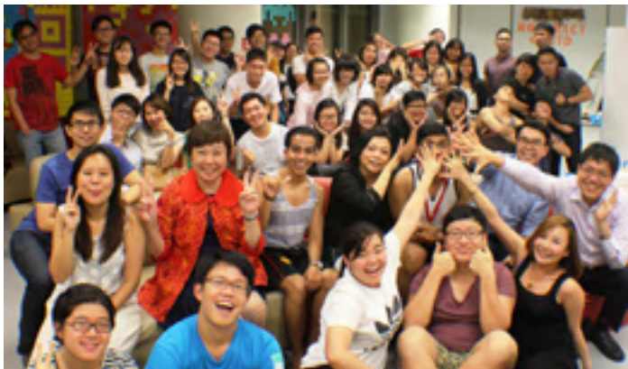
Installation of Rotaract Club of Singapore University of Technology and Design