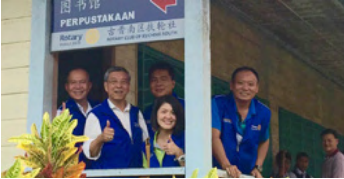
30th : Attending Rotary Club of Kuching South's library project