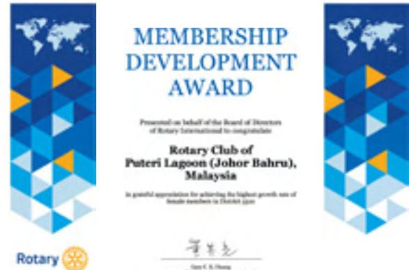
Rotary Club of Puteri Lagoon for achieving the highest growth rate in female members in D3310