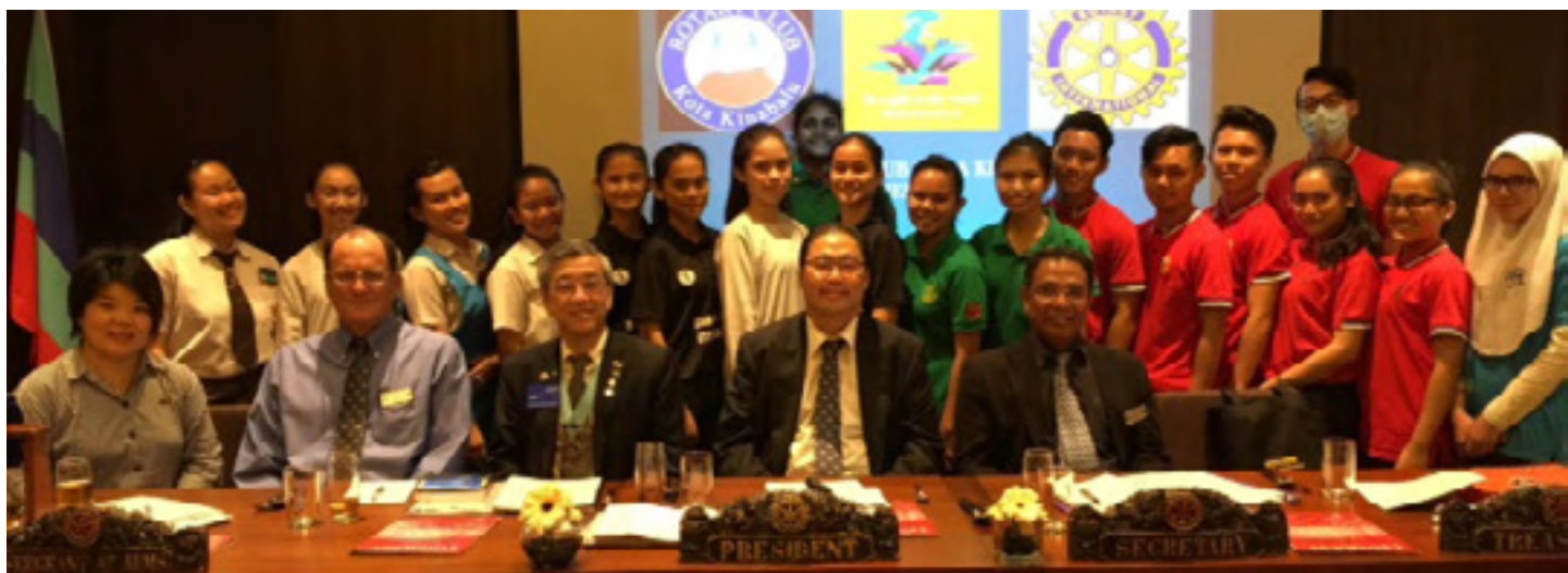
26th : DG Visit to the Rotary Club of Kota Kinabalu