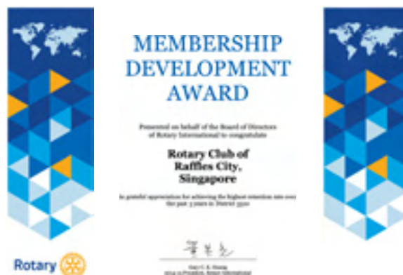
Rotary Club of Raffles City for achieving the highest retention rate over the past 3 years in District 3310