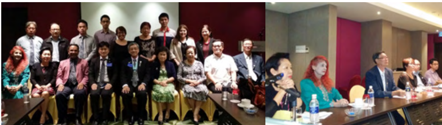
12th : DG Visit to the Rotary Club of Tanjung Aru