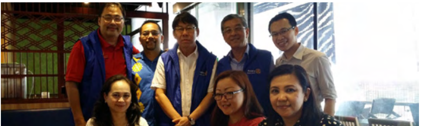
18th : Joint District 3300 & 3310 Eye to Eye Seminar at Oceanus, Kota Kinabalu