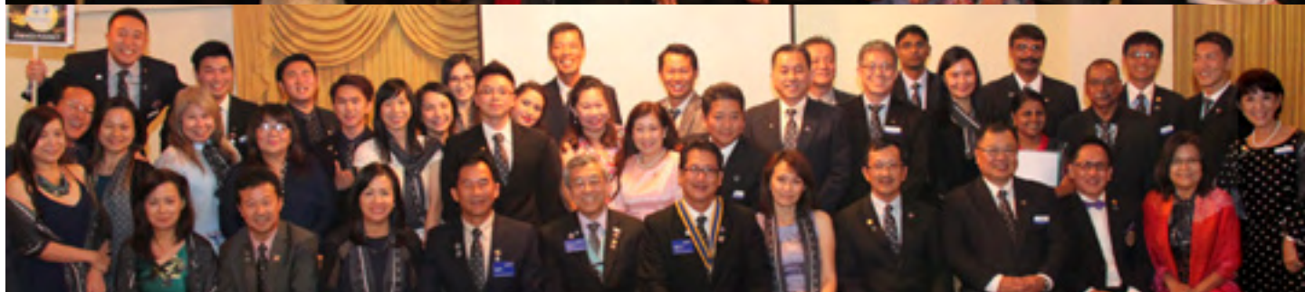
13th : DG Visit to the Rotary Club of Bandar Seri Begawan