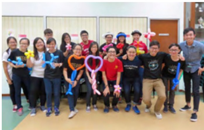
The Rotaract Club of Nanyang Polytechnic's Balloon Sculpting at Yong En Care Centre