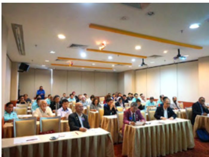
3rd : District Membership and Public Image & Relation Seminar in Kuching