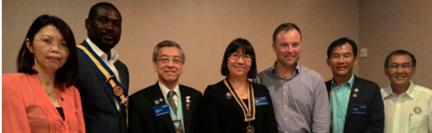
12th : DG Visit to Rotary Club of Belait