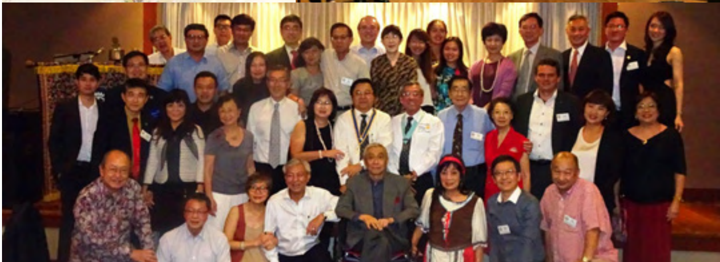
15th : DG Visit to the Rotary Club of Singapore West