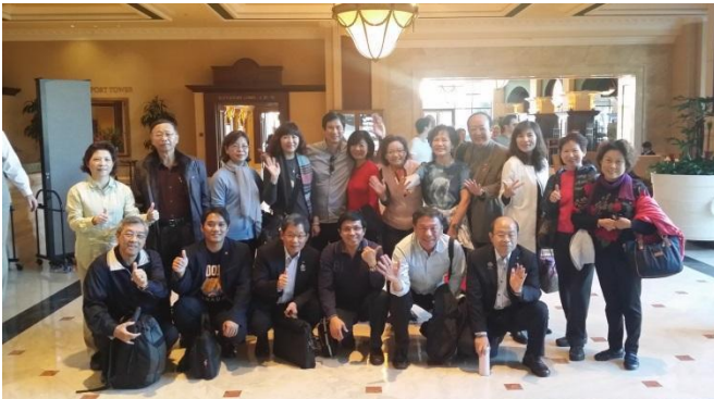
Group photo with Taiwan Incoming Governors & spouses before leaving Manchester Grand Hyatt

We packed our luggage and checked out from Manchester Grand Hotel by 10.00 am. Together with the Taiwanese Incoming Governors and spouses, we had lunch at Seaport Village before leaving San Diego for Los Angeles airport . On the way, we stopped for shopping and dinner before taking our flight by China Airline at 10.30pm.