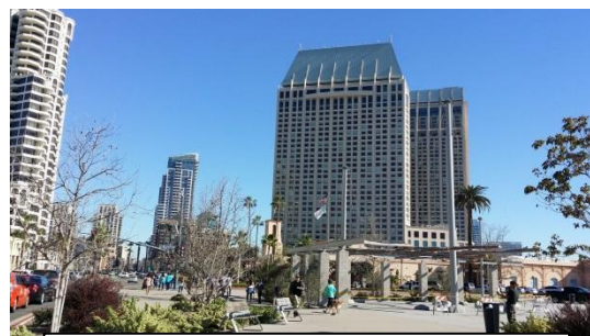
Manchester Grand Hyatt, San Diego