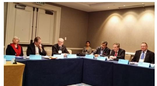
First training session....Idea Exchange:The Rotary Roadmap