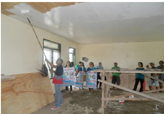
Zone 2D Rotarians Visited the newly Rehab School