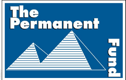
To secure tomorrow