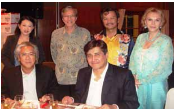
HE Ambassador of Mexico(seated right), who is himself partially blind, attended the gala dinner