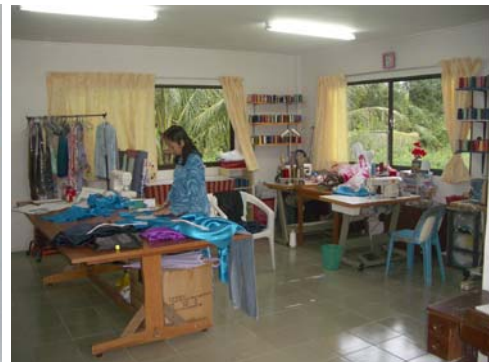
Above L & R : View of the interior of the workshop , Centre : Rotary Joint Project Plaque