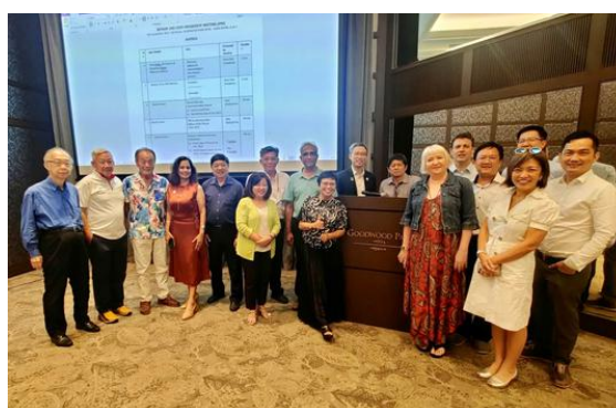
2 OCTOBER 2022 2ND JOINT PRESIDENTS' MEETING (SINGAPORE)