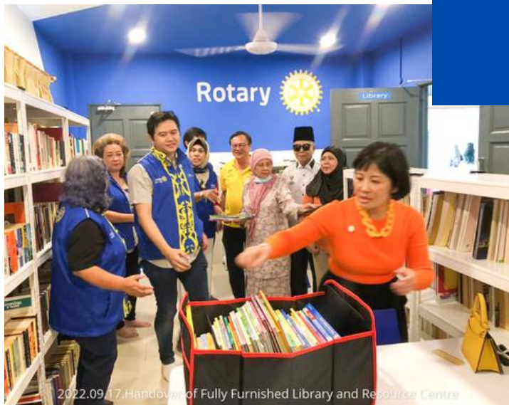
2022.09.17 Handover of Fully Furnished Library and Resource Centre

01/09/2022, As part of a RC Kuching Unity City effort to provide basic education and increasing literacy rates for children, students and parents around Kuching/Samarahan vicinity, fund raising efforts were carried out for books, cash, used laptops. This project is jointly organised with Rotary Club of Sri Kenyalang and Rotary Club of Kuching Jaya for the literacy center at Kampong Haji Baki Project.