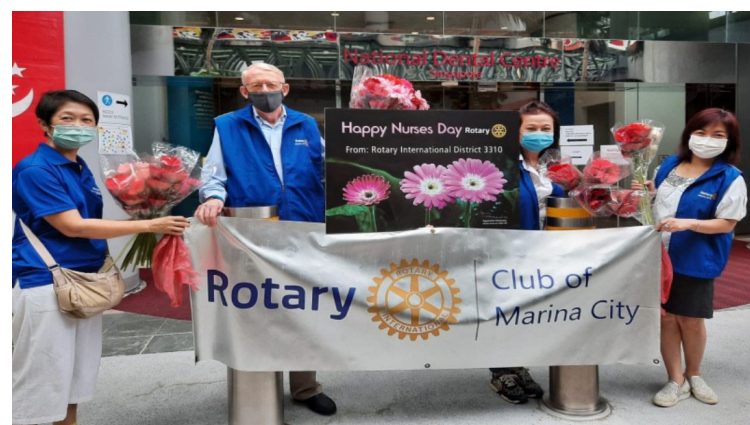
Rotary Club members from RC Marina City