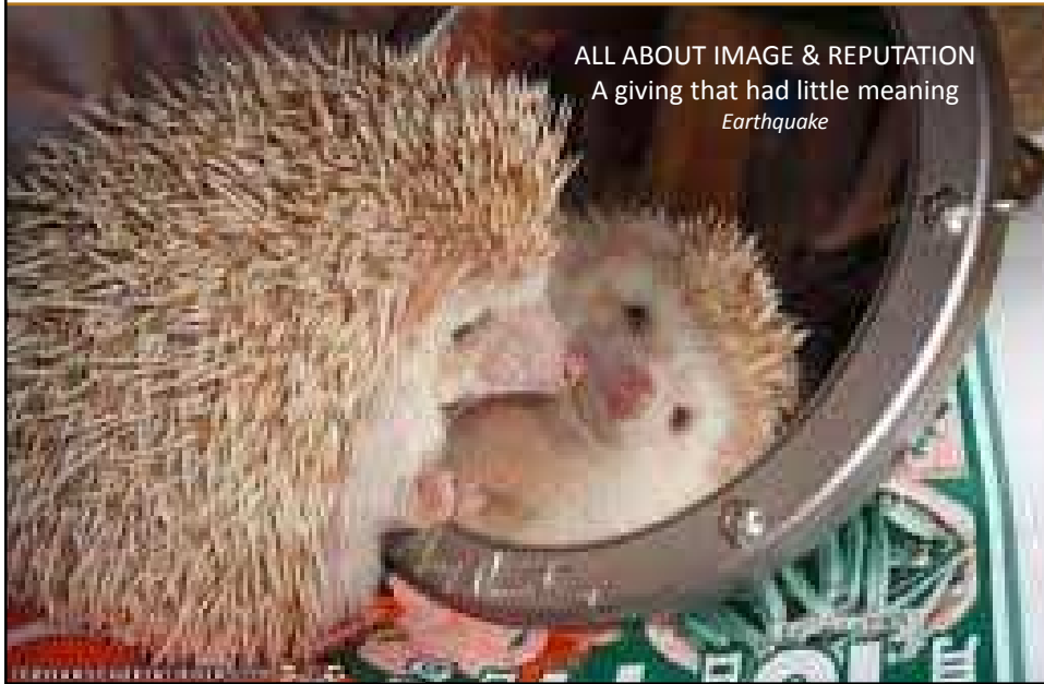
ALL ABOUT IMAGE & REPUTATION A giving that had little meaning Earthquake